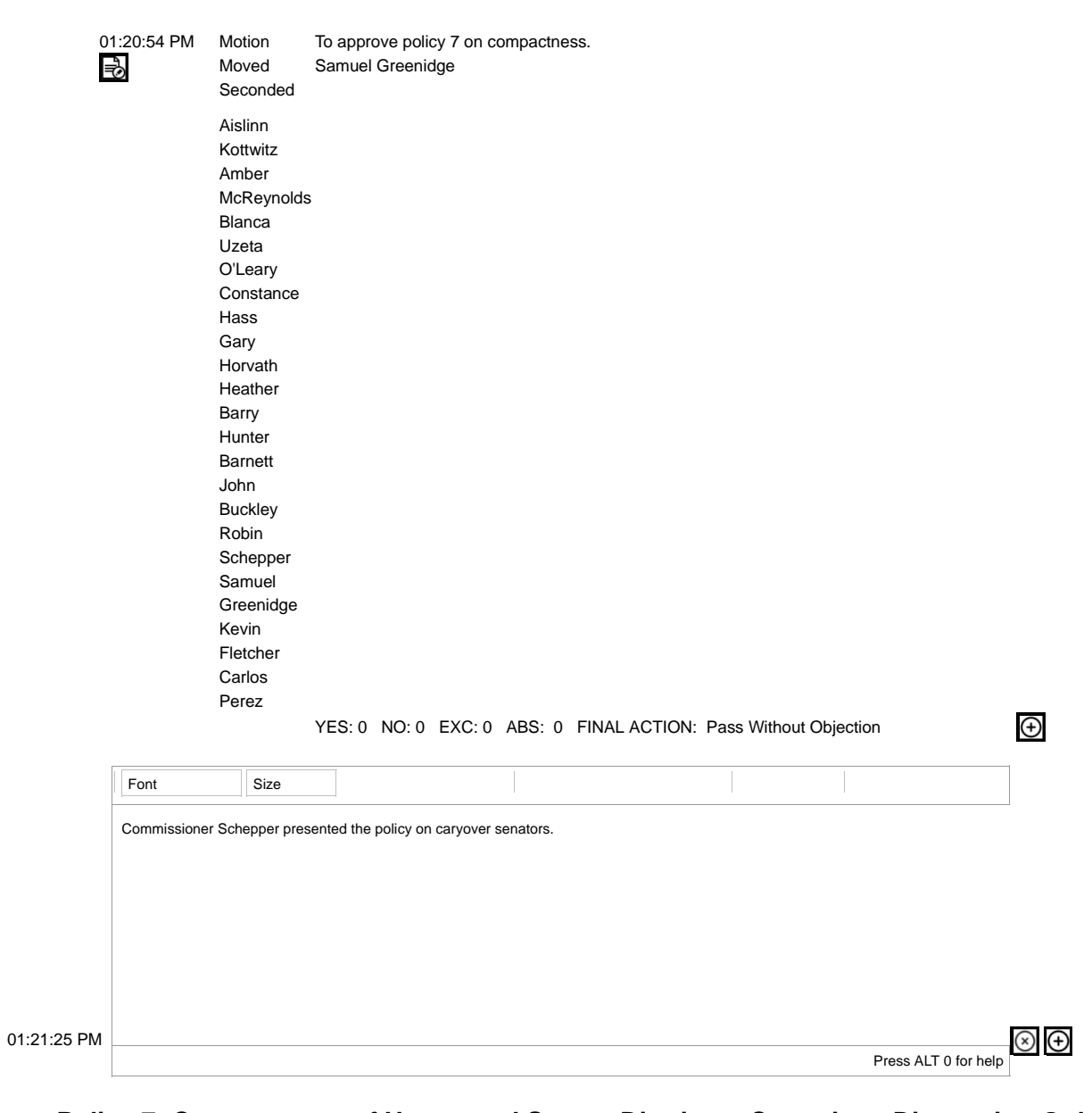
Policy 7: Compactness of House and Senate Districts - Committee Discussion Only